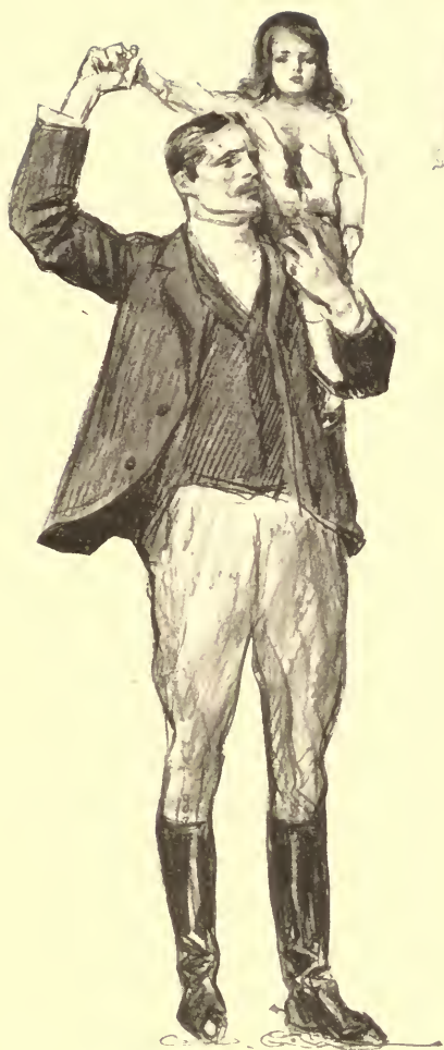
He swung the crown prince high upon his shoulder.